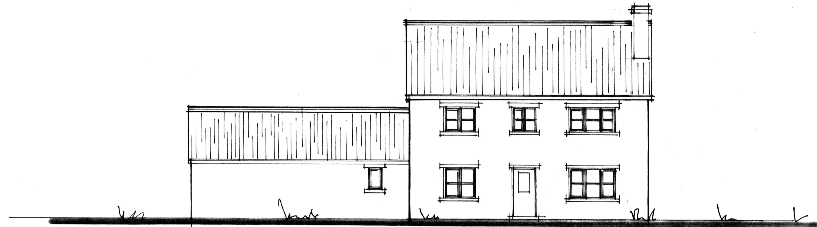
PROPOSED FRONT ELEVATION. (WEST.)