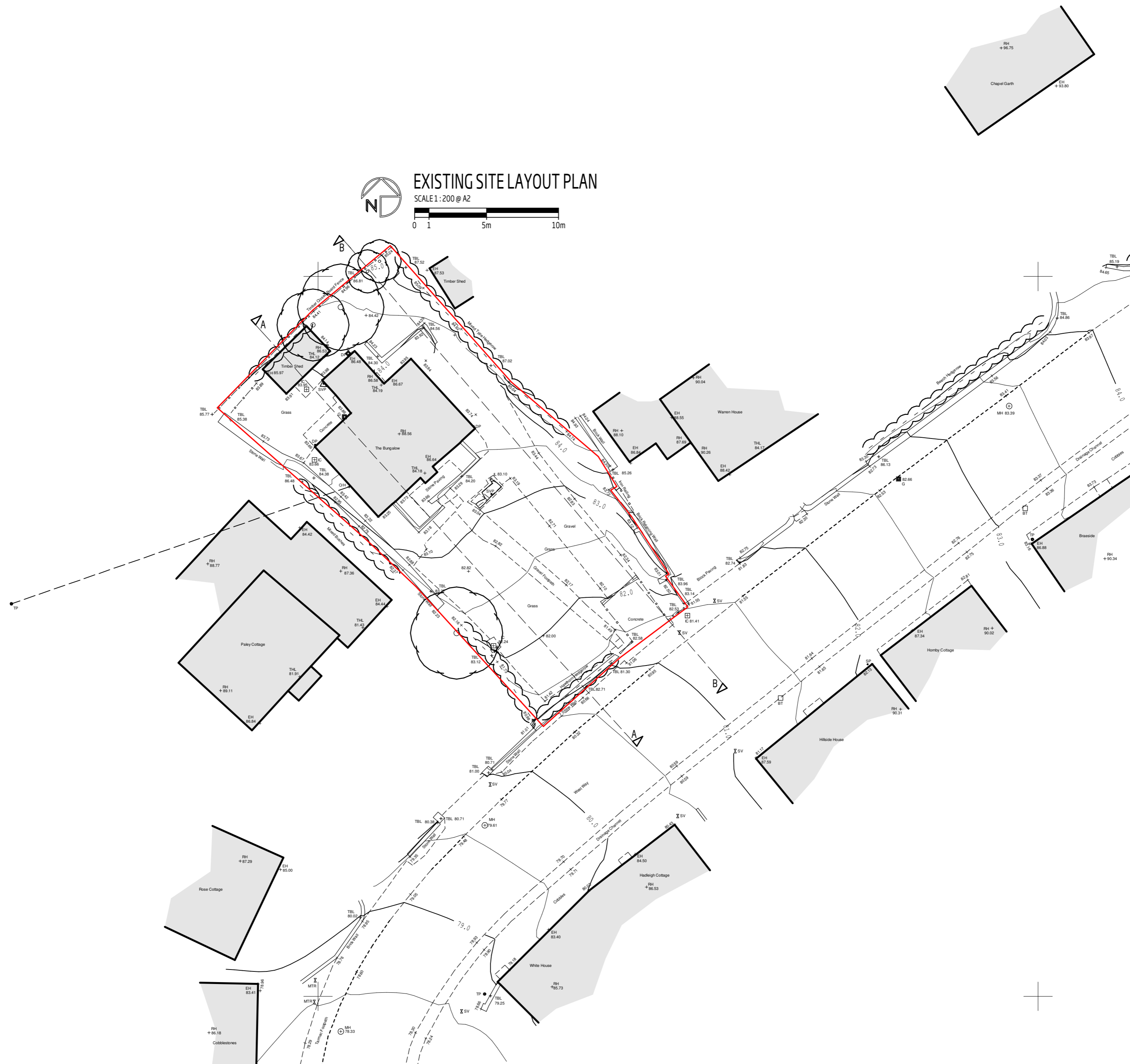
EXISTING SITE LAYOUT PLAN SCALE 1:200 @ A2

DESIGNER'S NOTES: DO NOT SCALE THIS DRAWING. ALL DIMENSIONS & LEVELS ARE TO BE CHECKED ON SITE PRIOR TO CONSTRUCTION. IF IN DOUBT ASK. THIS DRAWING IS TO BE READ IN CONJUNCTION WITH ALL OTHER RELEVANT DRAWINGS, DETAILS AND SPECIFICATION PROVIDED BY THE ARCH TECH, CLIENT, CONTRACTOR AND ALL OTHER CONSULTANTS INCLUDING STRUCTURAL ENGINEER, CIVIL ENGINEER, ENERGY ASSESSOR ET AL. SHOULD THERE BE A CONFLICT BETWEEN DRAWINGS AND DETAILS THE ARCH TECH SHOULD BE INFORMED PRIOR TO CONSTRUCTION. ALL WORK IS TO BE CARRIED OUT IN ACCORDANCE WITH THE CURRENT BUILDING REGULATIONS & MUST COMPLY WITH ROBUST DETAILS FOR LIMITING THERMAL BRIDGING & AIR LEAKAGE. UNTIL TECHNICAL APPROVAL HAS BEEN OBTAINED FROM THE RELEVANT AUTHORITY, IT SHOULD BE UNDERSTOOD THAT DRAWINGS ARE NOT FOR CONSTRUCTION UNTIL SUCH APPROVALS ARE OBTAINED. SHOULD THE CONTRACTOR COMMENCE SITE WORK PRIOR TO SUCH APPROVAL BEING GIVEN IT IS ENTIRELY AT THEIR OWN RISK.